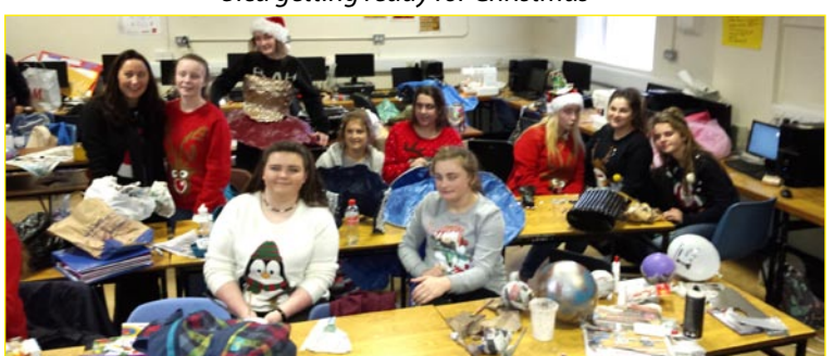
TY's busy creating outfits for "junk kouture"