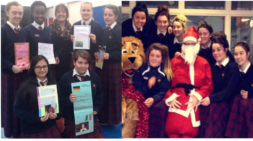
German Poster Competition